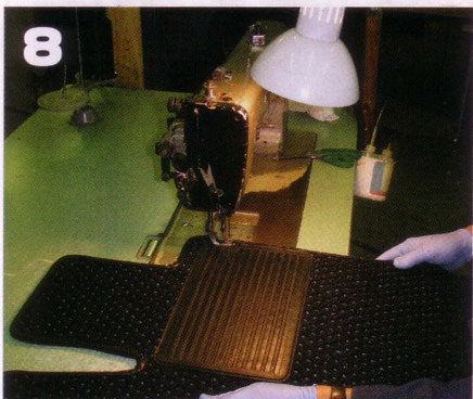
The driver's-side mat gets an added heel pad that protects the material from damage.