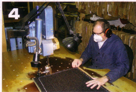
A jigsaw is used to cut out the material. A low-friction table prevents the material from bunching.