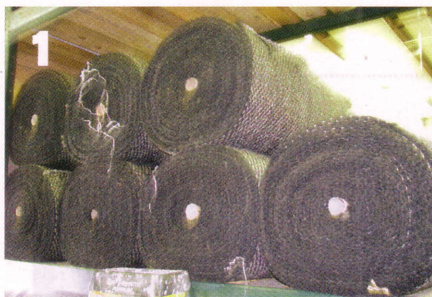
The coconut husk and sisal materials are woven into a fabric in India. The fabric arrives at the shop in large rolls.

Natural Auto Products (800) 461-3533 cocomats.com