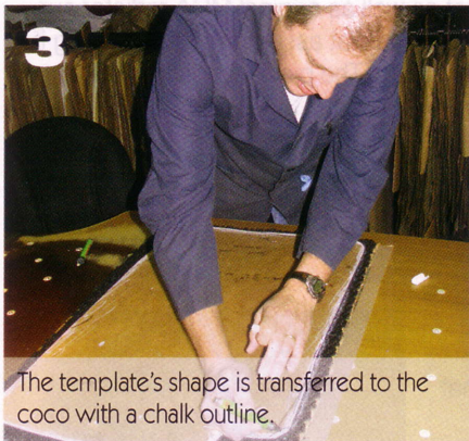
The template's shape is transferred to the coco with a chalk outline.