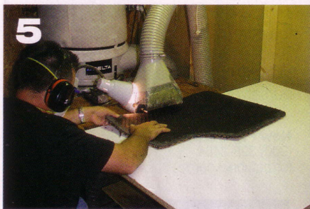
A rubber backing is added in a temperature- and humidity-controlled room.