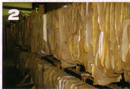
The mat shape is chosen from an inventory of more than 2500 templates.