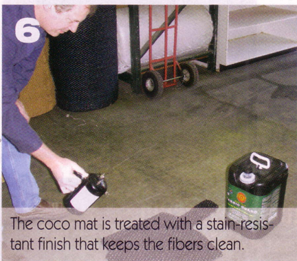
The coco mat is treated with a stain-resistant finish that keeps the fibers clean.