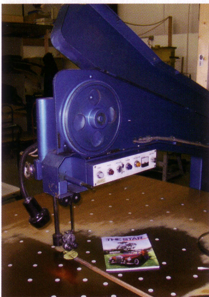
Table jig saw used to cut the cocomat to the appropriate pattern.

that they were used in cars before carpet, when there was only rubber on the floor. The coco material acted as a carpet but with the benefit that it allowed dirt and sand to filter through the coco material, so you did not see it on the top of the rubber floor matting. Porsche, VW, Mercedes-Benz, BMW, Triumph, and many other European cars supplied this type of floor covering. Cocomats were a big hit in the '50s through the '70s, even after carpet was introduced. There were two main U.S. companies and one company in Germany supplying cocomats during the years when they were popular. The cocomats during this period did not include any rubber backing and their quality depended upon which manufacturer you bought them from. Porsche and Mercedes-Benz original sales stickers included cocomats from the factory. These were the highest quality and came from the German manufacturer. One of the U.S. manufacturers