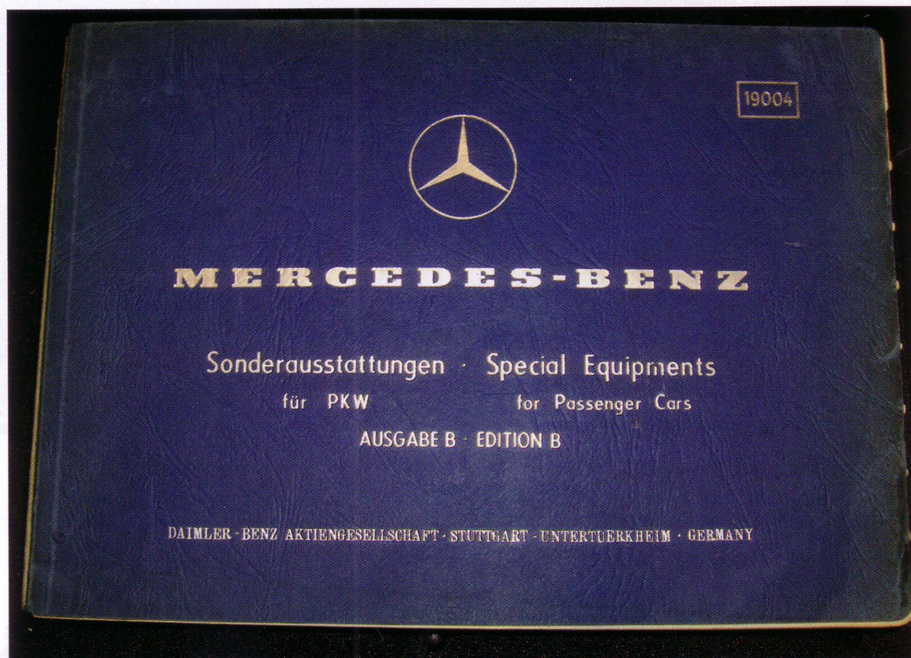
A rare copy of the original 1960 "options" catalog.