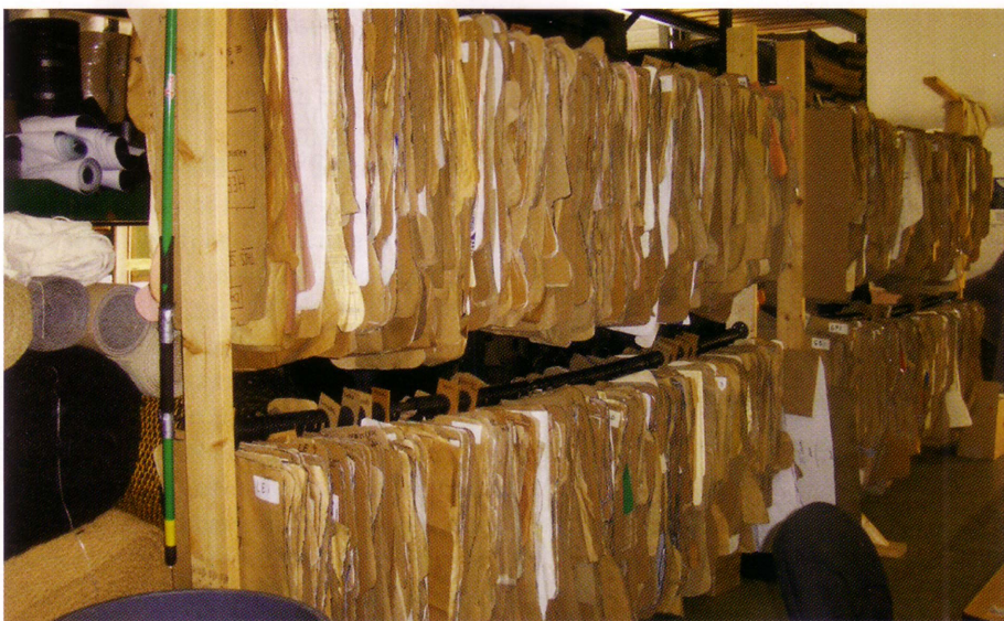
The family business jewels; over 2500 vehicle patterns.