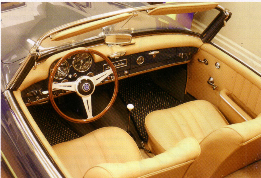
Blue cocomats with white dots in Wisconsin Section member John Lewenauer's 1950SL.

that they were used in cars before carpet, when there was only rubber on the floor. The coco material acted as a carpet but with the benefit that it allowed dirt and sand to filter through the coco material, so you did not see it on the top of the rubber floor matting. Porsche, VW, Mercedes-Benz, BMW, Triumph, and many other European cars supplied this type of floor covering. Cocomats were a big hit in the '50s through the '70s, even after carpet was introduced. There were two main U.S. companies and one company in Germany supplying cocomats during the years when they were popular. The cocomats during this period did not include any rubber backing and their quality depended upon which manufacturer you bought them from. Porsche and Mercedes-Benz original sales stickers included cocomats from the factory. These were the highest quality and came from the German manufacturer. One of the U.S. manufacturers